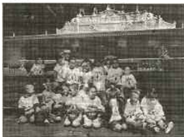
Some of the 25 terminally and chronically ill children from Denver's Hope Center at Disneyland, thanks to the Sunshine Foundation.