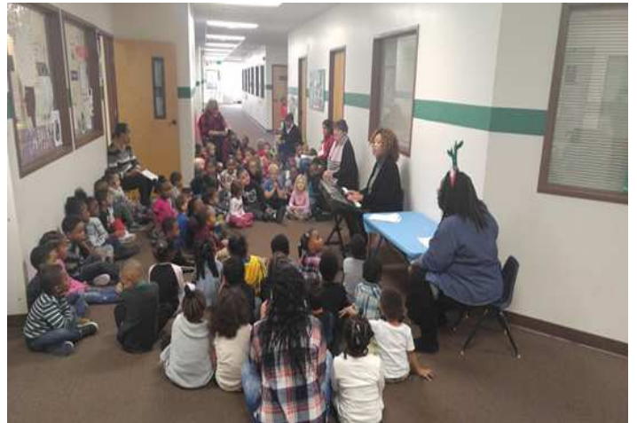
Children singing practice for Family Night