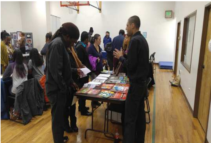
Kindergarten/1st Grade Transition Event