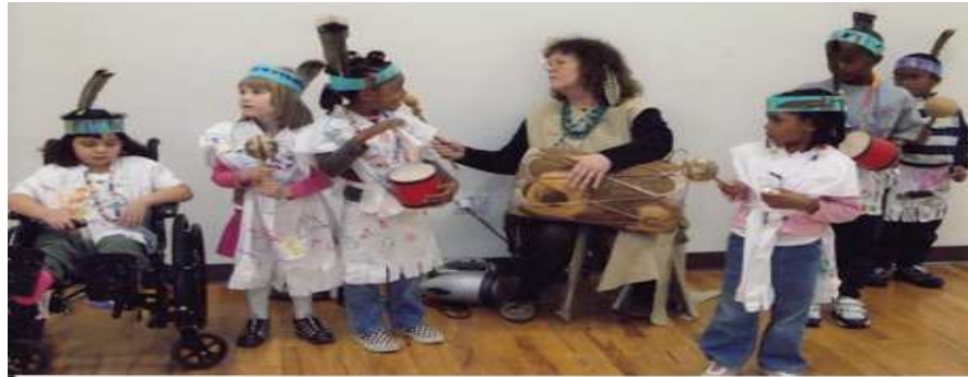
Family Night– Honoring Hispanic Heritage