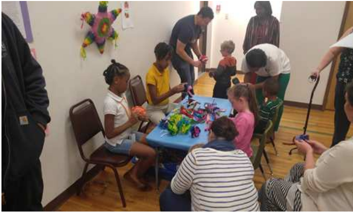
Family Night– Cultural Festival activities

visit us online at: www.hopecenterinc.org