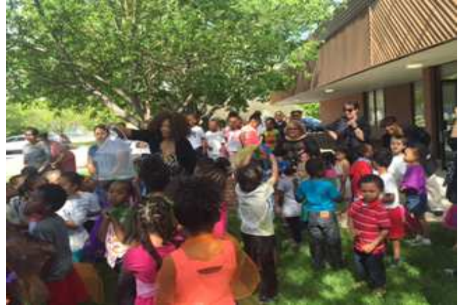
Outside classroom interactions